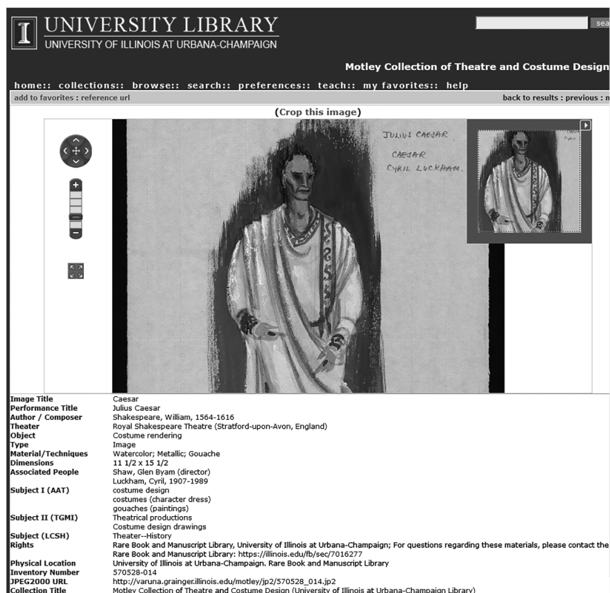
FIG 1. Digitized costume sketch from Motley Collection with original metadata.

Carefully mapping the Motley collection's legacy metadata model into the schema.org vocabulary (and any other linked-data-compliant vocabulary) begins by identifying these 1-to-1 violations in the existing metadata records. The resulting metadata records can then be divided into multi-part accounts that provide information particular to the different individual entities. Distinguishing the entities described is an essential first step in mapping legacy metadata into schema.org semantics and useful LOD-compatible descriptions. However, simply isolating and mapping the various entities described in the legacy metadata is not sufficient to make the metadata account optimal when displaying descriptions to users of these collections. The snippets of legacy metadata describing these additional entities must be enriched through the addition of links to external LOD services and other external resources (as described in Section 3 below).