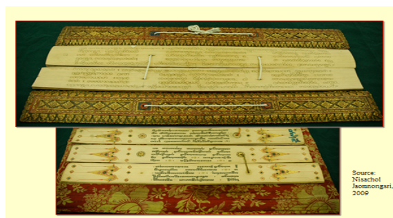
FIG. 1. Palm leaf Manuscript