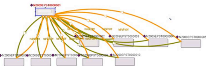
(b) Visualization of query result of journal BBA and its sub-works