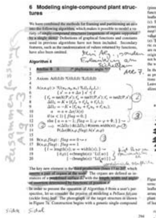
Figure 2: Annotation of paper documents.

How somebody annotates the document depends on the reading goal and on the personal likes and dislikes. The interesting aspect is that different annotation types have different meanings to the reader. Hence, it is worthwhile to analyze the annotations and to classify annotations based on their types. This allows the typespecific visualization of annotations. Furthermore, it is often necessary to store information about the annotation such as the name of the author and the date of creation. Especially if the chronological order of annotations is important. Both can be achieved using SVG which combines the possibilities of storing annotation data using simple geometric models and the description of the annotation